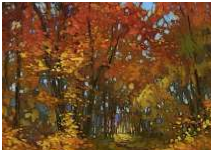
'Autumn colours' by Jan Schmuckal. ©