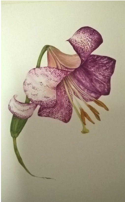
Day lily. Watercolour on paper by C. Cansfield-Smith.