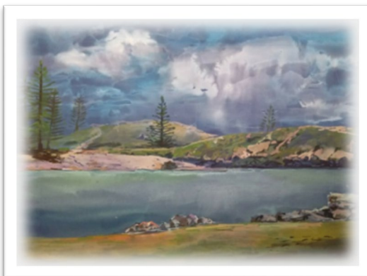
A cloudy day at Emily Bay'. Gouache on colour fix pastel paper by Wendy Stephens