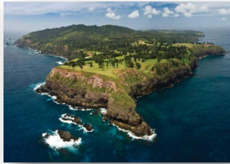
Aerial view of Norfolk Island