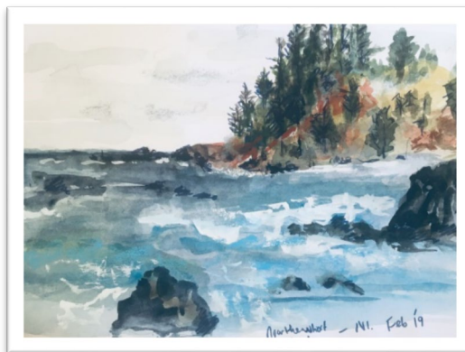
'Emily Bay'. Watercolour on paper by Judi Moncur