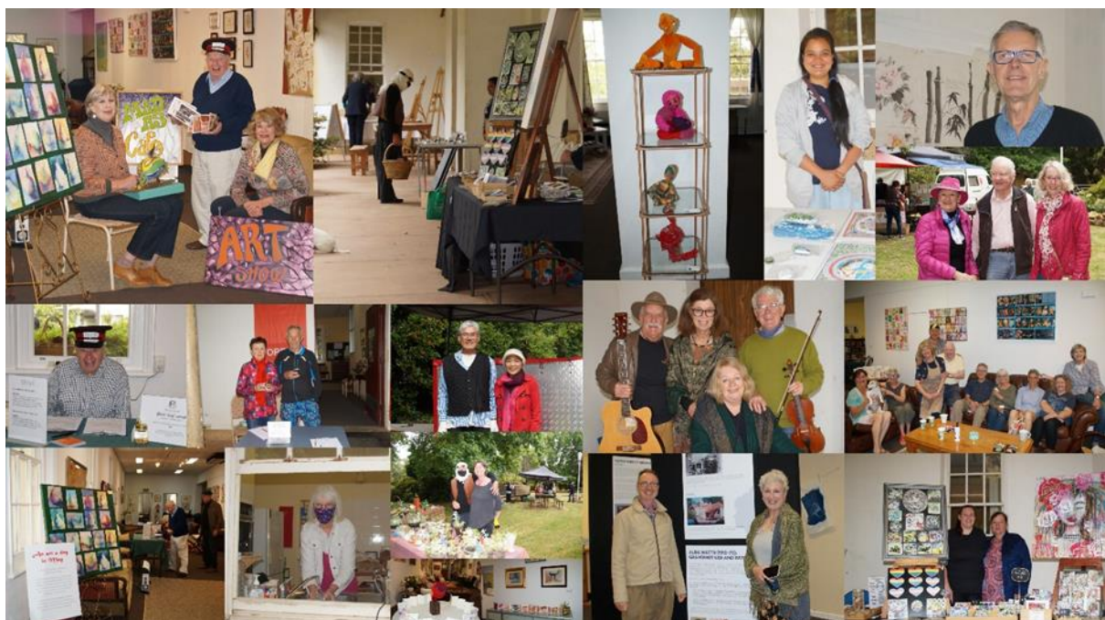
Open Day at the Mayday Hills Art Society, Sunday 6 December, 2020.

The Mayday Hills Art Society is a non-profit organisation located in Beechworth, Victoria. Its mission is to be a centre of excellence in the arts and sciences. Its aim is to provide innovative activities to encourage creativity, advance the talents of people in the visual and performing arts, sciences and environment and provide opportunities for the exchange of ideas to benefit the communities of northeast Victoria.